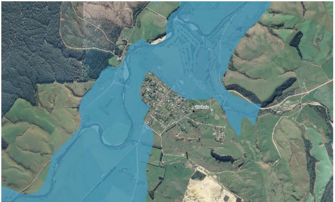
Figure 3: Waikāia Flood Map