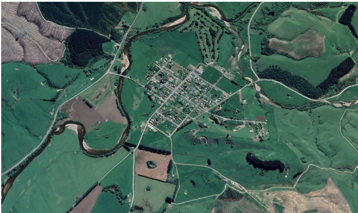
Figure 2: Waikaia Township