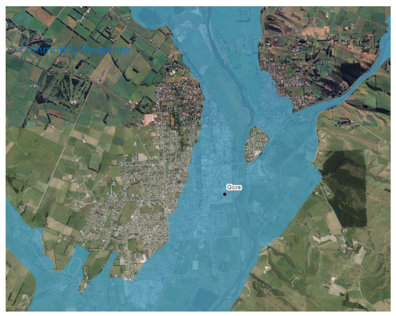
Figure 3: Gore potential flood Map