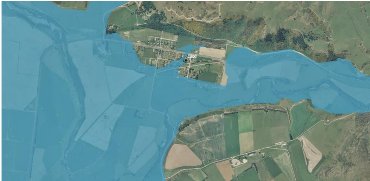
Fig 3: Athol Potential Flooding Zone