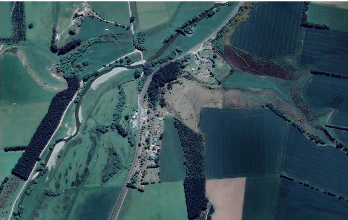
Fig. 6 Garston Aerial