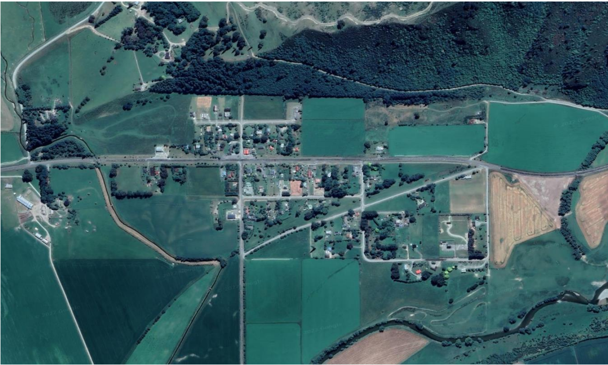
Fig. 5 Athol Aerial