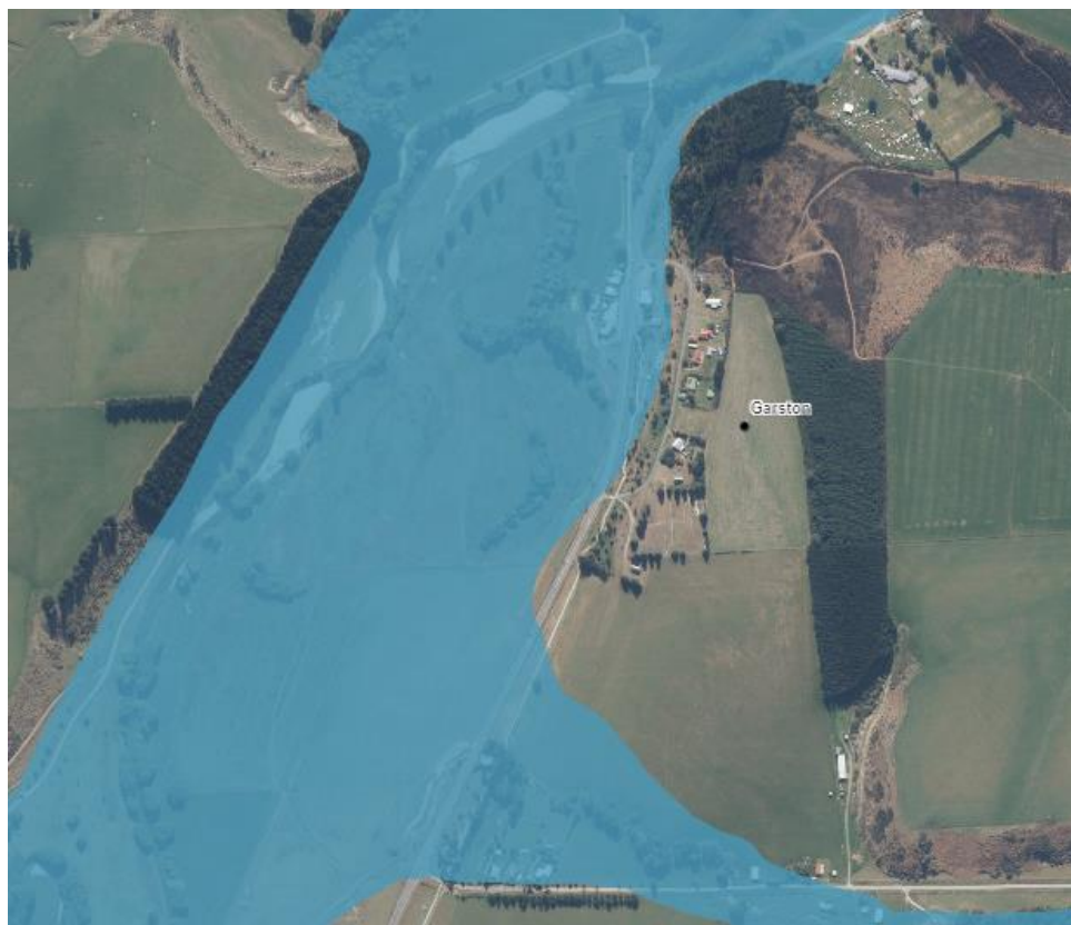
Fig 4: Garston Potential Flooding Zone