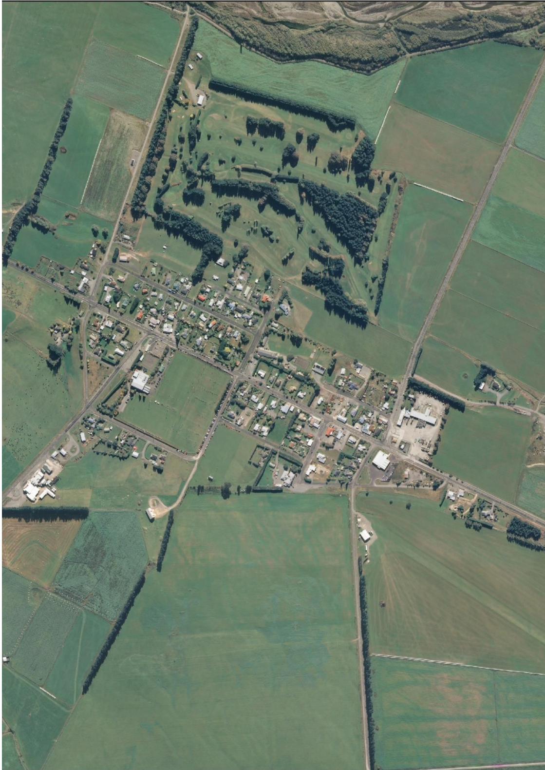
Figure 3: Mossburn Arial Map