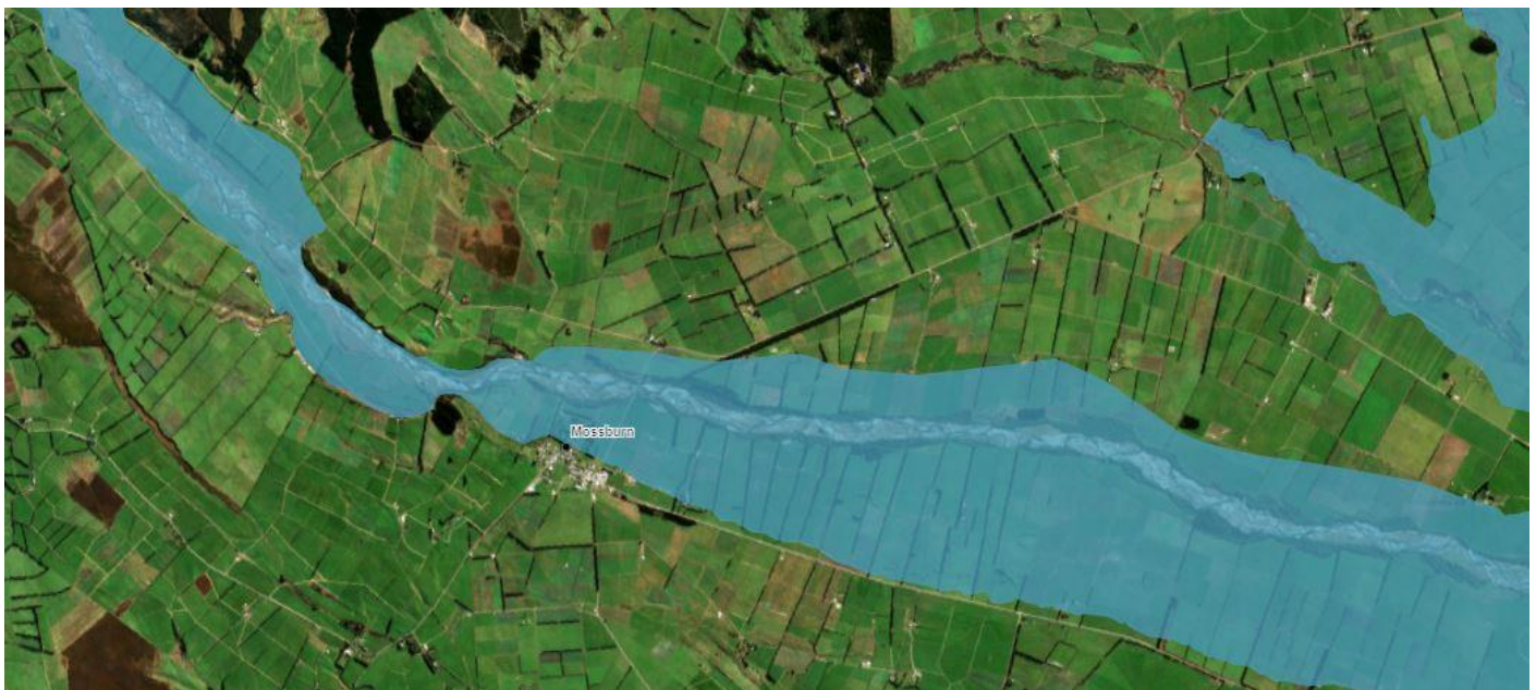
Figure 4: Mossburn Flood Map