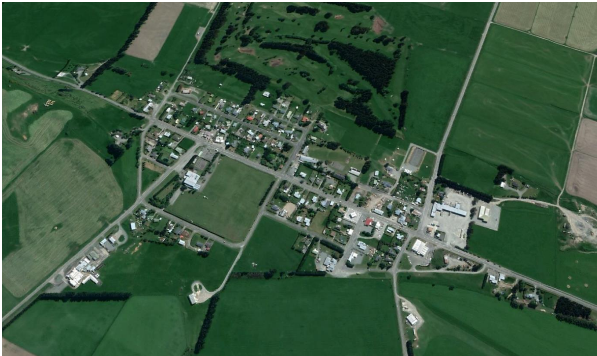
Figure 2: Mossburn Town