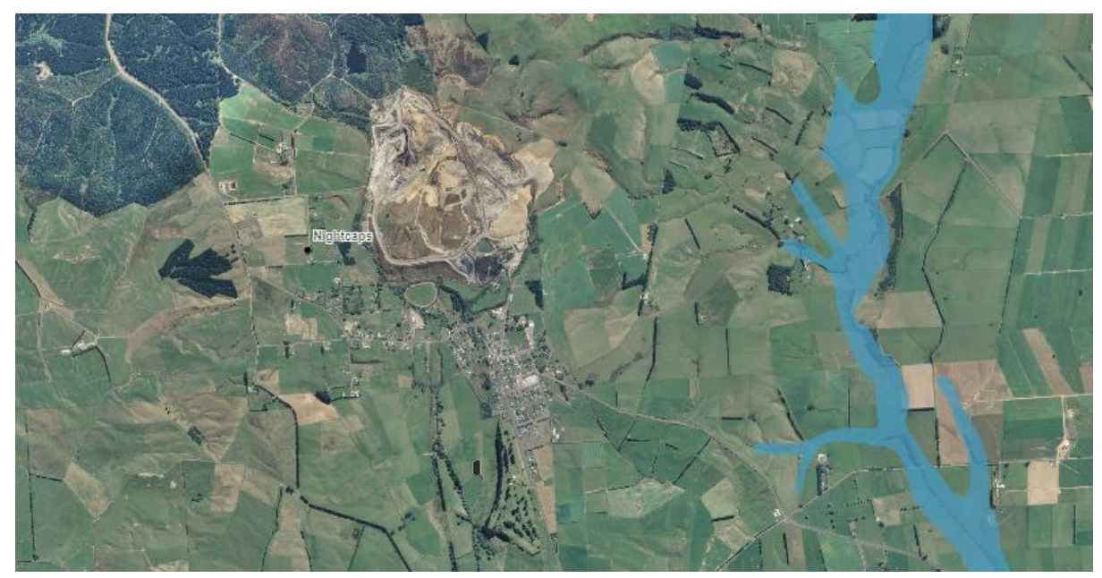
Figure 4: Nightcaps Flood Map