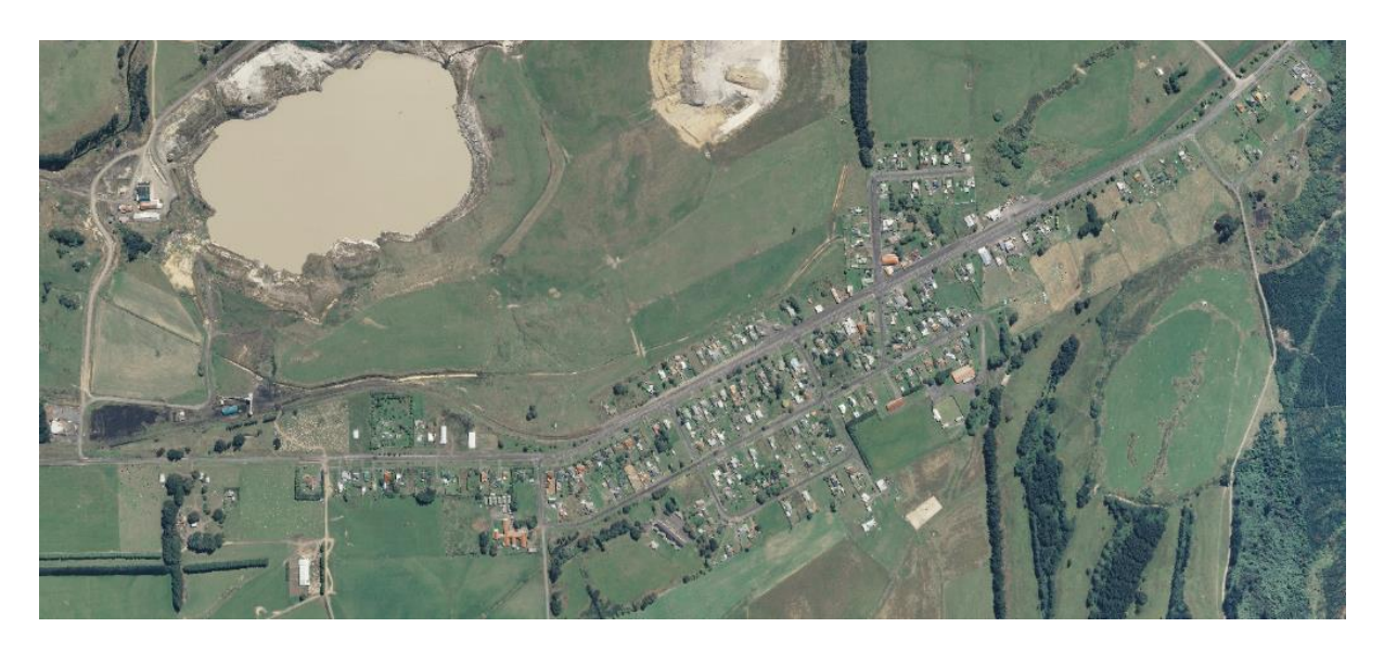
Figure 1: Ohai Aerial Map