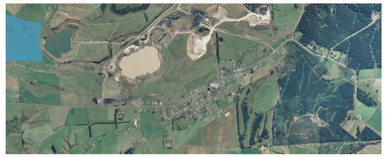
Figure 3: Ohai Flood Map