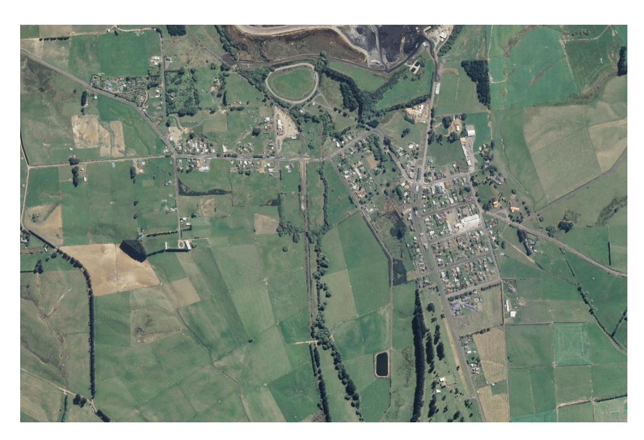
Figure 2: Nightcaps Aerial Map