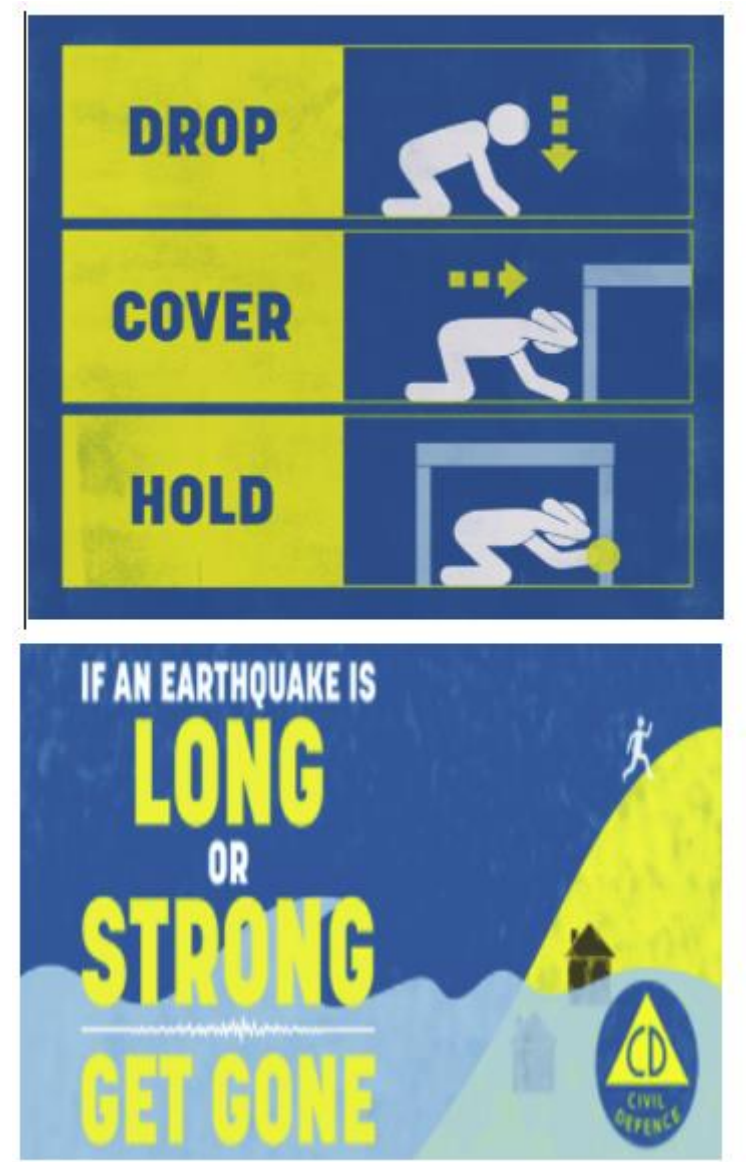
Otautau Community Response Plan 2019 Find more information on how you can be prepared for an emergency <u>www.cdsouthland.nz</u>

Please take note of natural warning signs as your first and best warning for any emergency.