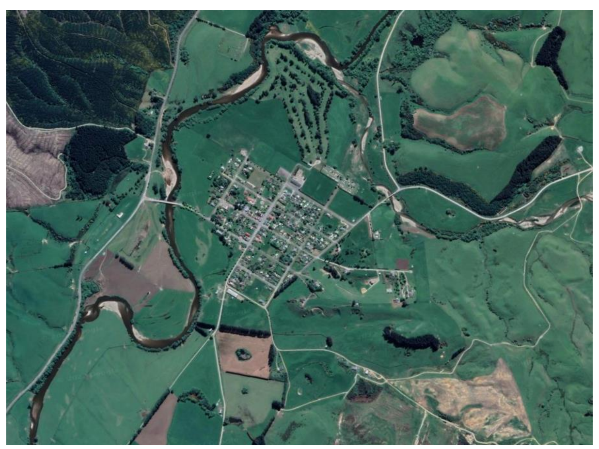
Figure 4: Waikaia Aerial