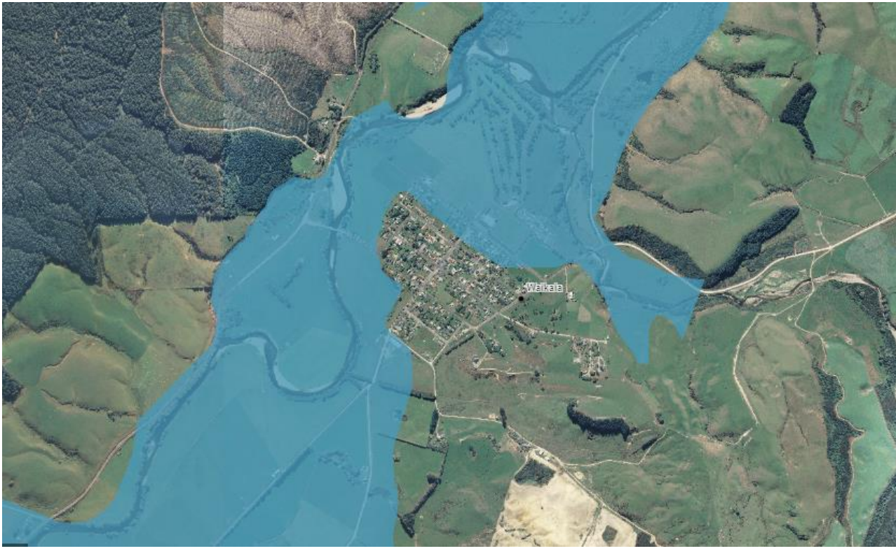
Figure 2: Waikaia Potential Flooding Zone

Waikaia has been affected historically by flooding, including the 1978, 1984, and 2020 floods with the Waikaia River running through the district. Bridges are vital infrastructure that also carry telecommunications, water and other services across rivers, these could also be impacted by flooding. Many areas in the community rely on bridges to connect with homes and employment, this leads to isolated communities.