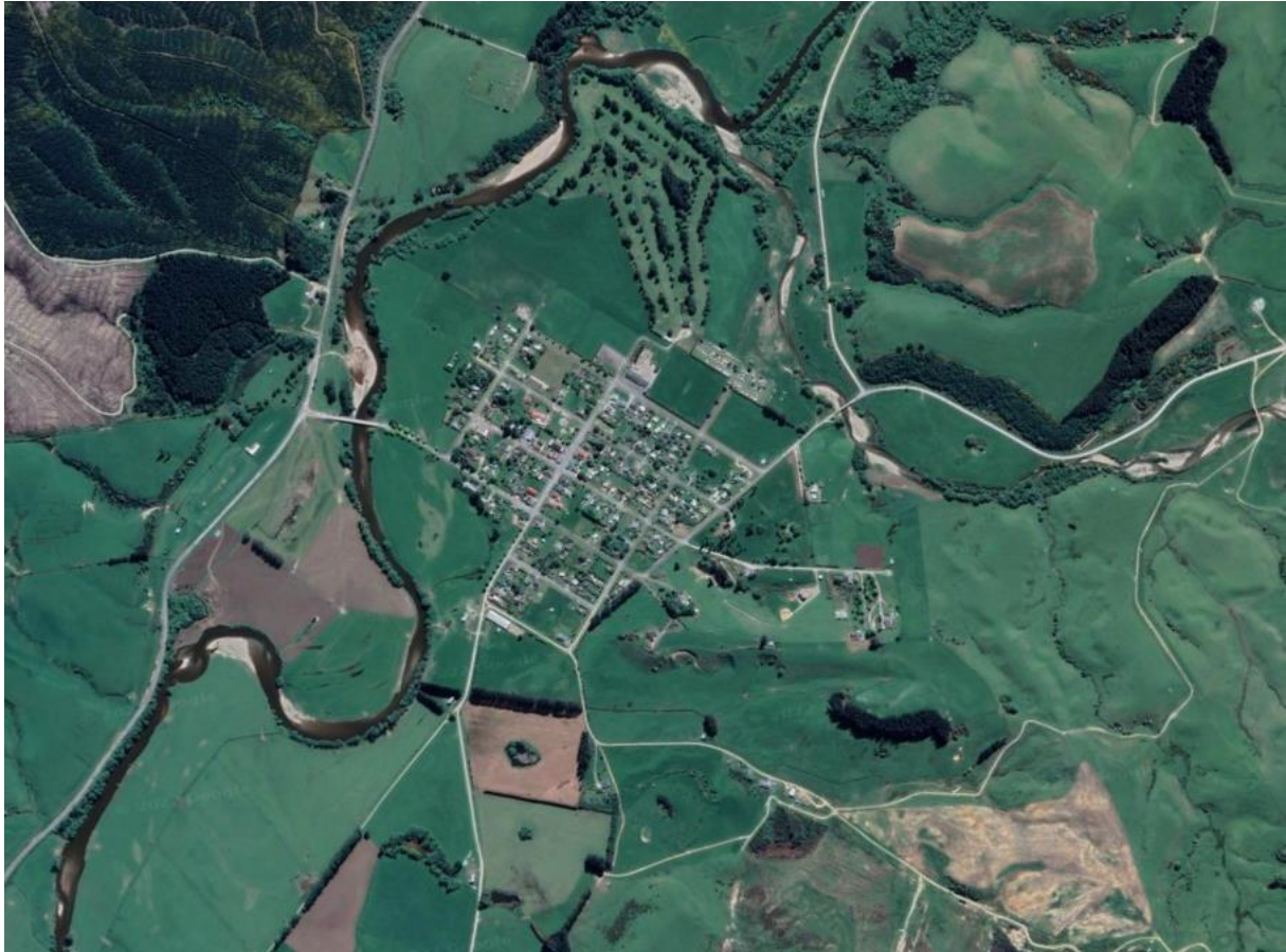
Figure 4: Waikaia Aerial