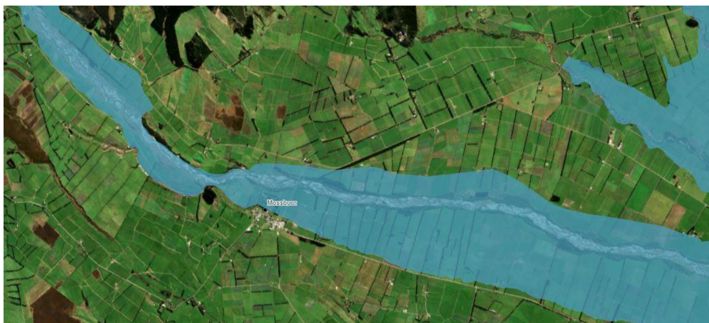
Figure 4: Mossburn Flood Map