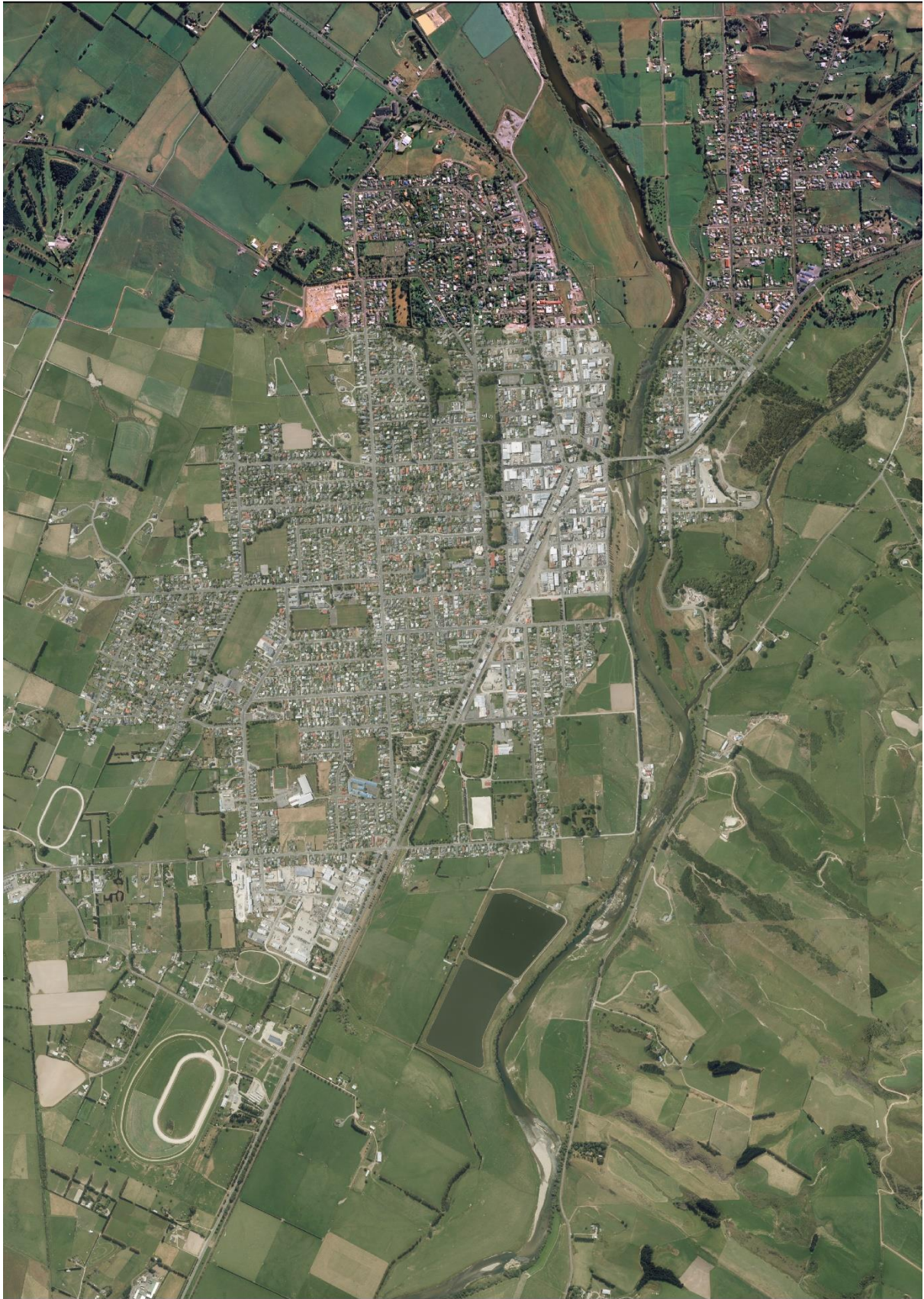
Figure 2: Gore Aerial Map