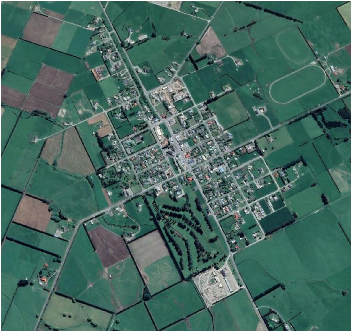
Fig 4: Riversdale Aerial