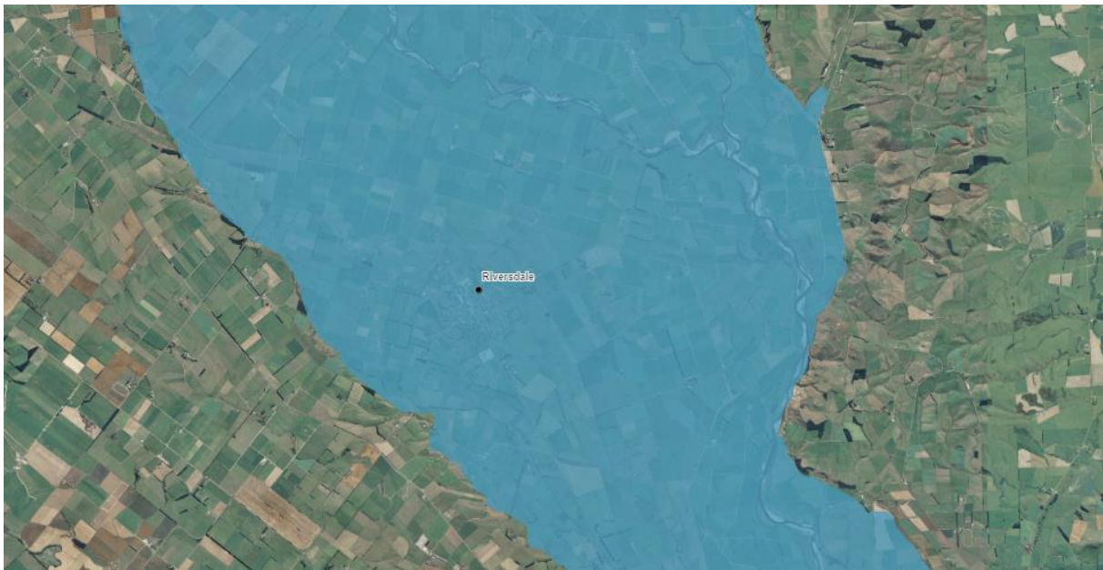
Fig. 2: Riversdale Potential Flooding Zone