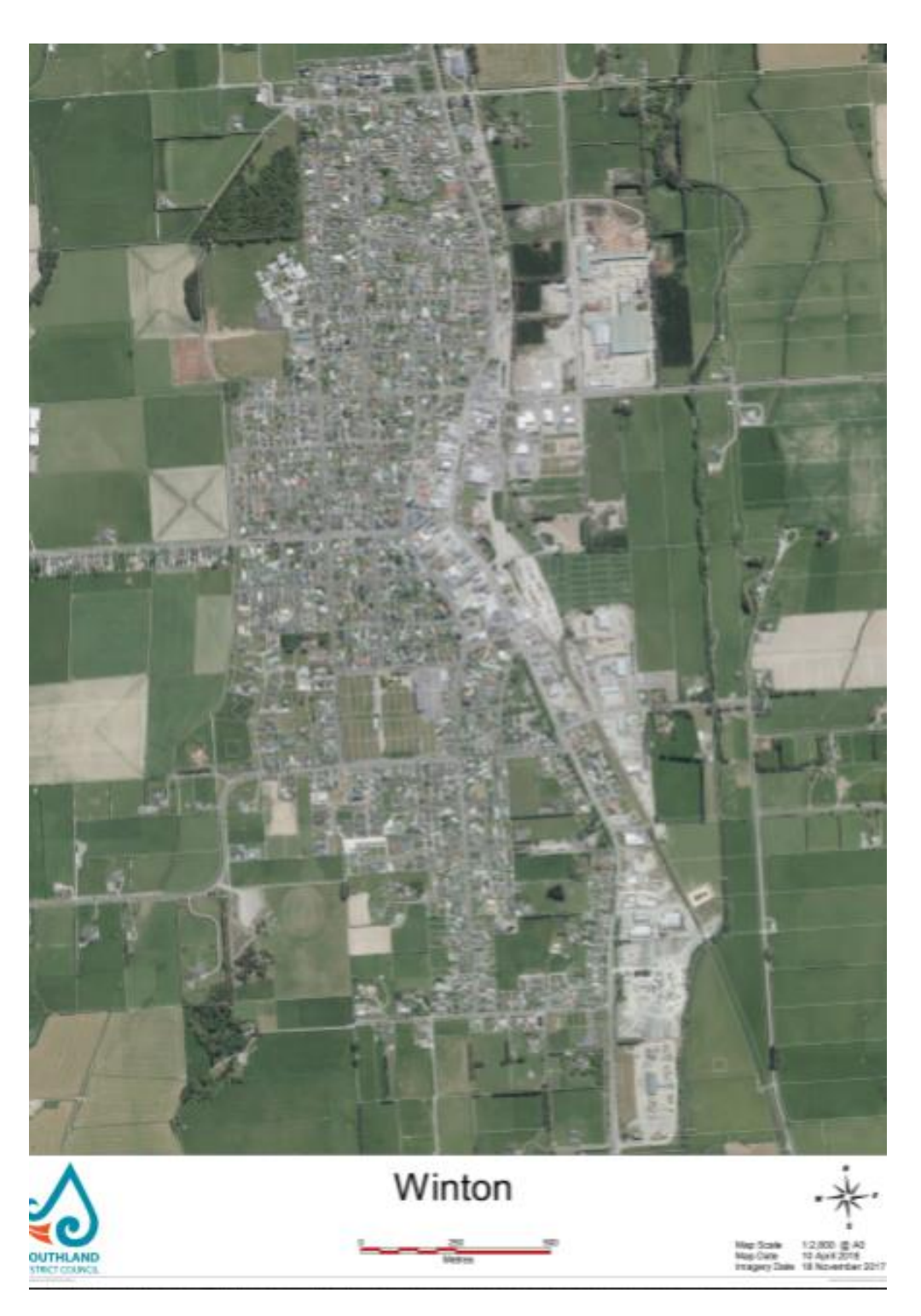
Copies of this property map will be available on the Emergency Management Southland Website and hard copies available with each Community Emergency Hub Guide and at the library in Winton.