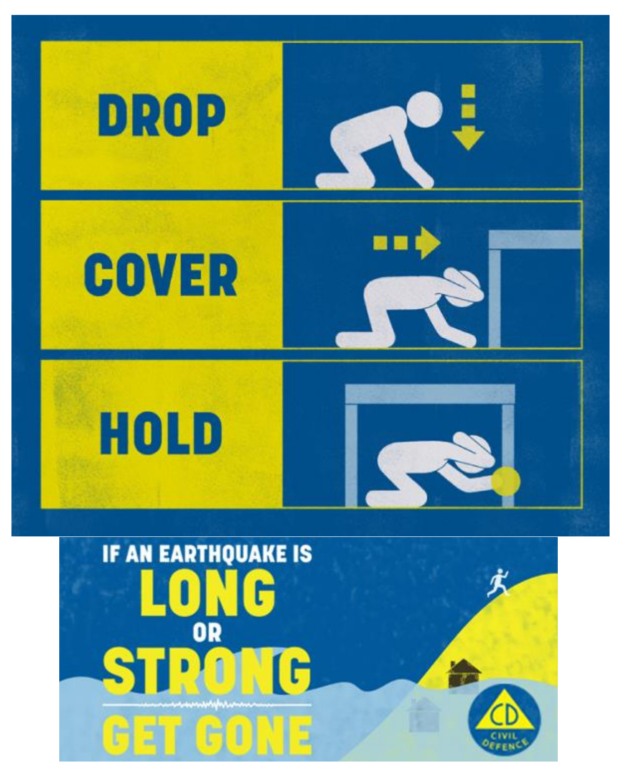
Otatara Community Response Plan 2019 If you'd like to become part of the Otatara Community Response Group

(fire brigade sirens are not used as warnings for a Civil Defence emergency)