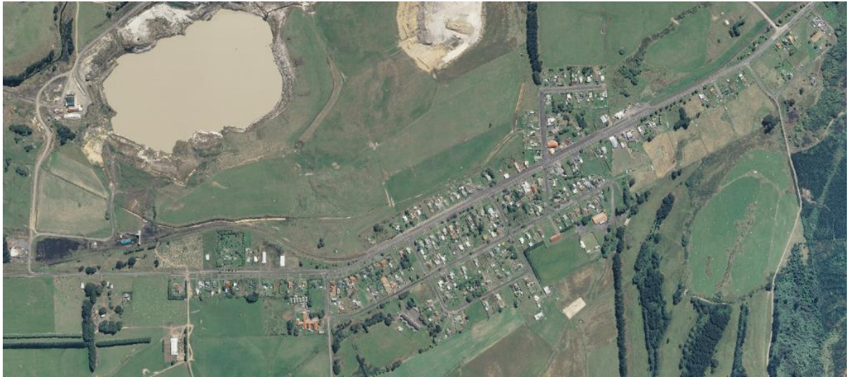
Figure 1: Ohai Aerial Map