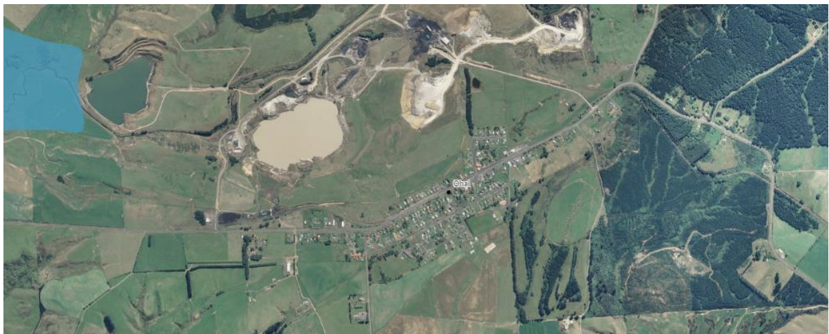
Figure 3: Ohai Flood Map