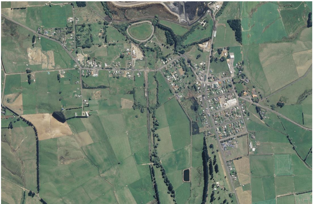
Figure 2: Nightcaps Aerial Map