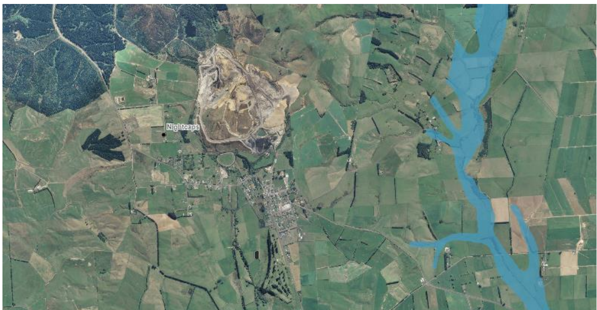
Figure 4: Nightcaps Flood Map