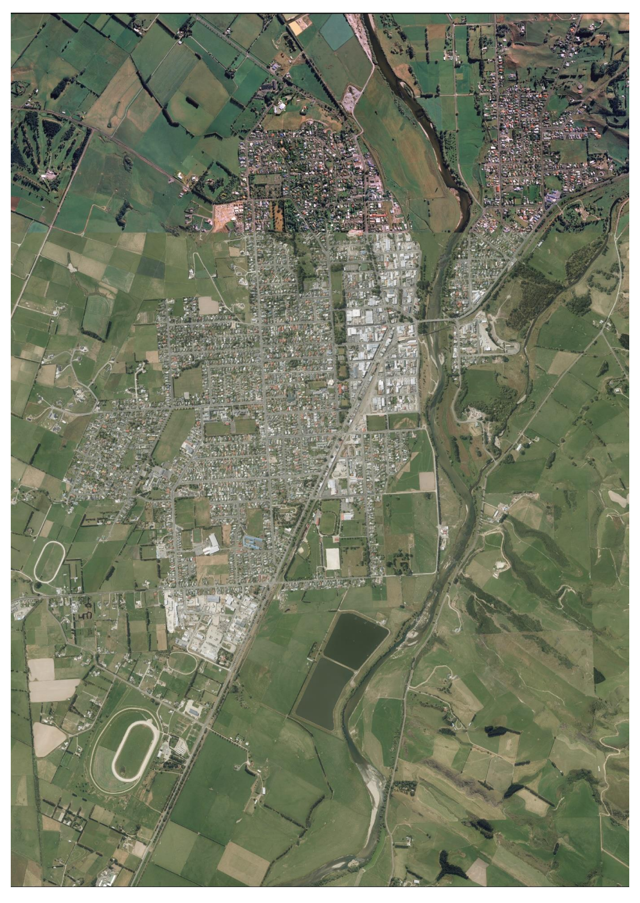
Figure 2: Gore Aerial Map