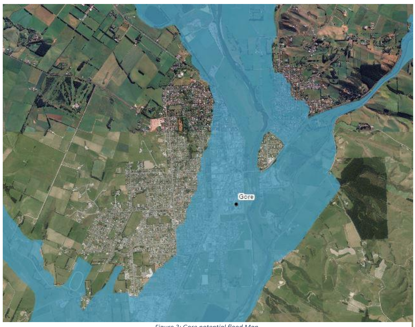
Figure 3: Gore potential flood Map