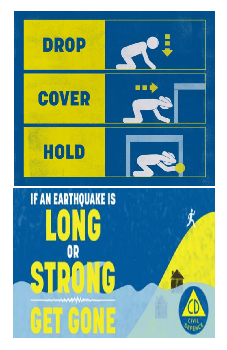
Edendale Community Response Plan 2018

(fire brigade sirens are not used as warnings for a Civil Defence emergency)