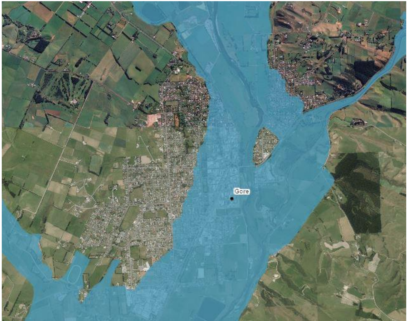
Figure 3: Gore potential flood Map